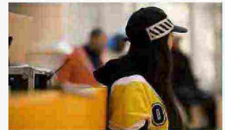
Here's Our Review of Off-White's FW16 Show in Paris