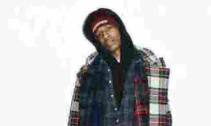
A$AP Rocky Explains Why He Wanted to Collaborate With GUESS